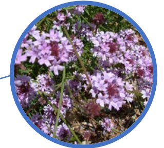
Verbena lilacina 'De La Mina' Cedros Island Verbena