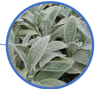
Stachys byzantina 'Silver Carpet' Lamb's Ears Silver Carpet