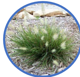
Pennisetum alopecuroides 'Little Bunny' Little Bunny Fountain Grass