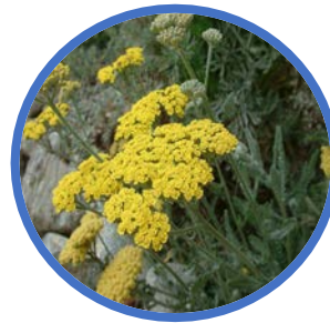
Achillea millifolium 'Moonshine' Yarrow Moonshine

Transform that 6'x12' patch of grass next to your driveway into a vibrant and dynamic landscape!